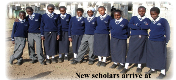
New scholars arrive at Jomo Kenyatta High School