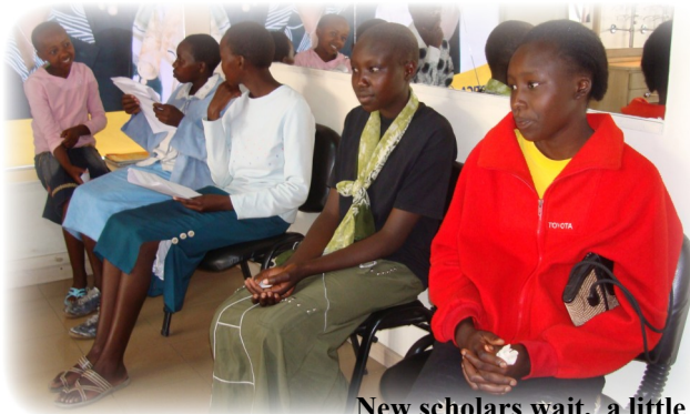
New scholars wait, a little apprehensively, for eye tests

□ Secondary - Scholarships currently cost £500 per year for five years. That includes tuition, boarding costs, uniform, books, eye tests, and essential items such as a mattress, trunk, bucket, extra tuition in the holidays and pocket money. It also covers costs during the gap year. If there is a surplus after secondary education, this is added to the general tertiary fund. Scholars write to their sponsors three times a year and the sponsors reply.