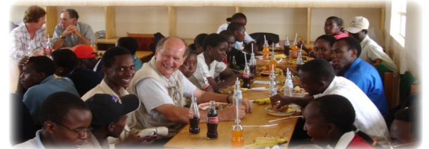
Enjoying Founder's Day

□ Tertiary - Tertiary scholarships are only available to existing scholars and include university and college fees, subsistence, and essential items such as books. Cost varies hugely but averages around £2,000 per year. It is hoped that sponsors will be willing to assist with tertiary fees although there is no obligation at this stage.